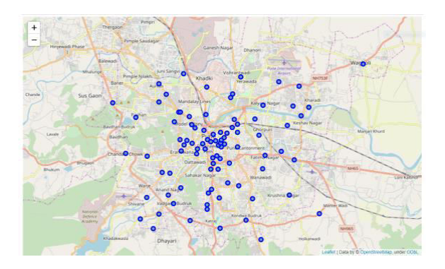
Figure 1:Localities in Pune City

leaflet of a map using geographical co-ordinates and latitude, longitude values.