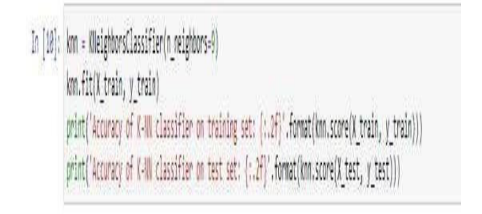
Figure 5.2. The variation of the outcome