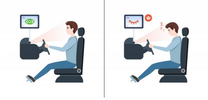
Fig -1: Figure

Driver drowsiness detection system is basically designed to reduce the number of accidents caused due drowsy driving. This system is based on android. To increase the accuracy of this system various algorithms or ideas get proposed. In some ideas the system checks the eyes open or not, some detect the driving pattern of driver and then blow the alert. Our system is based on android were using the camera of mobile we will detect the eyes of driver is open or not.