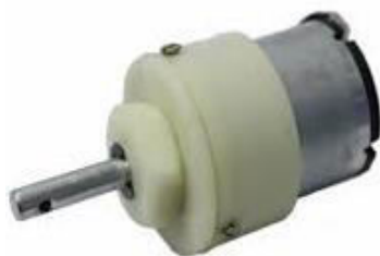
Fig. 2 DC Motor

DC motor is an electrical machine that utilizes electric power resulting in mechanical power output. Normally the motor output is a rotational motion of the shaft. The input may be direct current supply or alternating supply. But in case of DC motor direct current is used. The mechanism of dc motor is like a bar wound with wire is placed in between 2 magnets having North and South Pole. When it is provided with electric supply the wire becomes energized resulting in rotational motion which leads to rotational output. Here we are using two 100 rpm dc motors for wheel driving and one 300 rpm dc motor for rotating the mop.