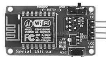
Fig: 4 WIFI Module

ESP8266 is a system on chip low-cost WiFi module with inbuilt TCP/IP stack. By ESP8266 we can send or receive information remotely by authenticates the user. The ESP8266 help the device or sensors for connecting to internet . Wi-Fi(Used ESP8266 due to very low cost Wi-Fi microchip) is also used to send or receive the information to or from the server or control room, so that lights can be also controlled from server [11]. This module has a great sufficient on-board dispensation and storage ability that allows it to be integrated with the sensors and other application specific devices through its GPIOs with minimal development up-front and minimal loading during runtime. Its high degree of on-chip addition allows for minimal external circuitry, including the front-end module, is designed to occupy minimal PCB area. The ESP8266 supports APSD for VoIP applications and Bluetooth co-existence interfaces; it holds a self-calibrated RF allowing it to work under all working conditions, and involves no external RF parts.