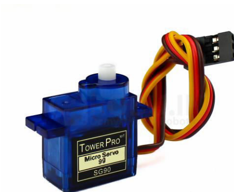
Fig: 6 Micro Servo Motor S90g

It is tiny and lightweight with high output power. This servo can rotate approximately 180 degrees (90 in each direction), and works just like the standard kinds but smaller. You can use any servo code, hardware or library to control these servos. It comes with a 3 horns (arms) and hardware.