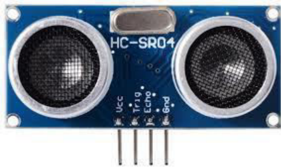
Fig. 2 ultrasonic sensor