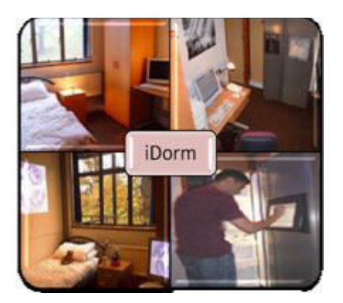
2.2 Neural networks

This project is one of the best examples of smart environment. However they did not mention or present any search data which shows how much energy was saved.