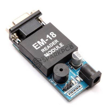
Fig 6 – EM – 18 RFID Module

This module directly connects to any microcontroller UART or through a RS232 converter to PC. It gives UART/Wiegand26 output. This RFID Reader Module works with any 125 KHz RFID tags.