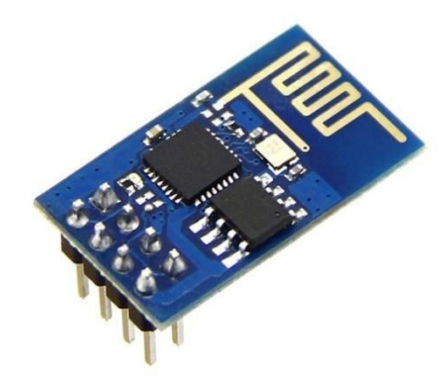
Fig 5 – ESP8266 WIFI Module

The ESP8266 is a low-cost Wi-Fi microchip with full TCP/IP stack and microcontroller capability produced by manufacturer Espressif Systems in Shanghai, China.