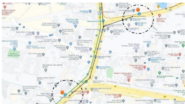
ROUTE MAPPING-ArcGIS Online is the web-based