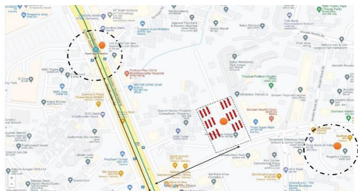
ROUTE-ANAND NAGAR BUS STOP TO KASARVADAVLIMETRO