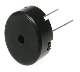
Fig -7: Buzzer

or piezoelectric. Typical uses of buzzers and beepers include alarm devices, timers and confirmation of user input such as a mouse click or keystroke. If embedded system is misplaced from dashboard, the IR sensor becomes active. The signal is sent to microcontroller to ring the buzzer. It is connected to the pin no.28 of microcontroller. Operating Voltage -5V