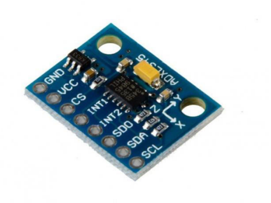
Fig -3: MEMS Sensor

takes up to 5V in and regulates it to 3.3V with an output pin.