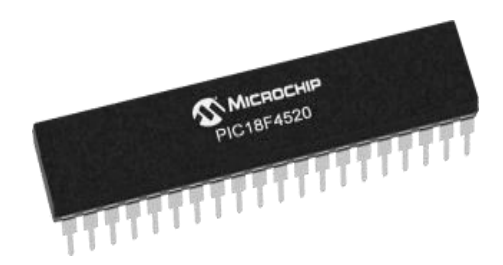
Fig -2: PIC18f4520 Microcontroller