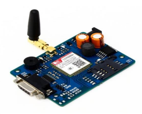
Fig -5: GSM Module

This GSM modem has a SIM800A chip and RS232 interface while enables easy connection with the computer or laptop using the USB to Serial connector or to the microcontroller using the RS232 to TTL converter. Once you connect the SIM800 modem using the USB to RS232 connector, you need to find the correct COM port from the Device Manger of the USB to Serial Adapter. Then you can open Putty or any other terminal software and open a connection to that COM port at 9600 baud rate, which is the default baud rate of this modem. Once a serial connection is open through the computer or your microcontroller you can start sending the AT commands.