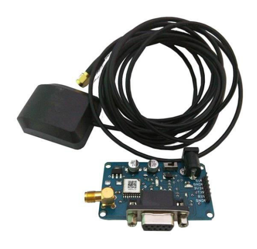
Fig -4: GPS Module

Nowadays, GPS technology has become more accurate, smaller, reliable, and economical. A very sensitive and accurate GPS signal acquiring device is required for the system. HI-204III Ultra High Sensitive GPS module is proposed for this project. Why we go for a GPS here is to provide additional information to the rescue about the location where the accident has been occurred. It would be quite useful to them to send rescue team without any delay. The receiver continuously tracks all satellites in view and provides accurate satellite positioning data .Since we had to provide more accurate and faster data so that it could be easy for emergency or rescue team to save a life. However the data will contain geographical details like latitudes and longitudes. Now days goggle maps provide a very good services for accessing a particular location using latitude and longitude coordinates. So the GPS with its 20 parallel channels and 4000 search bins provide fast satellite signal acquisition and short start up time which is<8 second in hot start and <40 second in cold start. Tracking sensitivity of -159dBm offers good navigation performance even in urban areas having limited sky view.