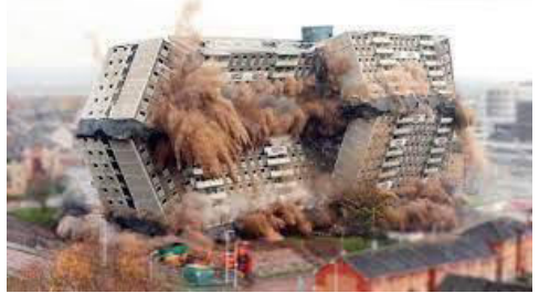
Fig.3 Collapsing Of Building