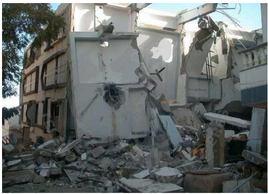
Fig.2 Bhuj Earthquake In India