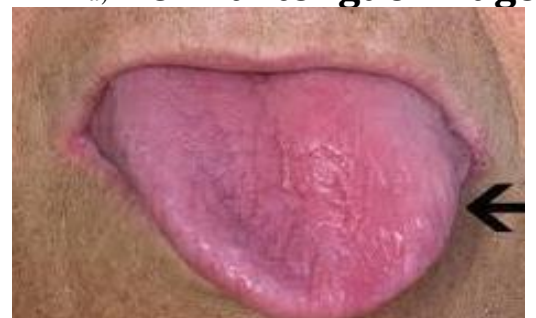
b) Metastasis image