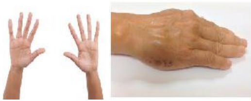
a) Normal Hand Image b) Acrometastatic analysis affected hand image