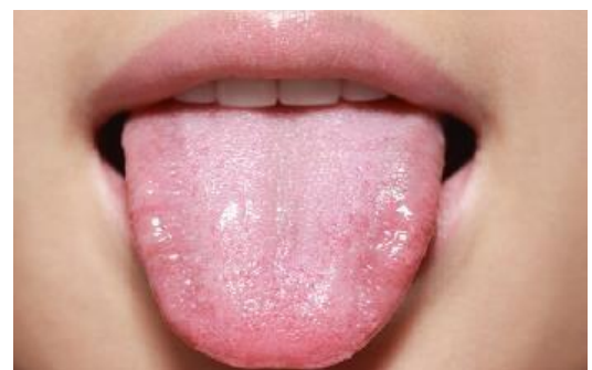
a) Normal tongue Image

The classification done is to distinguish the influenced portion with the metastasis and the Lingual acrometastatic. The outcome will help in finding the underlying side effects of lungs cancer of a specific individual.