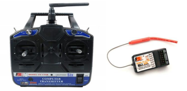
Fig-4: Transmitter & Receiver module

Device that uses radio signals to transmit commands wirelessly via a bunch frequency over to the tuner that is connected to a quadcopter being remotely controlled. In other words, it's the device that interprets pilot's commands into movement of the multirotor. RC 2.4 GHz receiver is employed for the receiving signal which is transmitted from RC transmitter. The receiver is additionally connected to the flight controller. It's