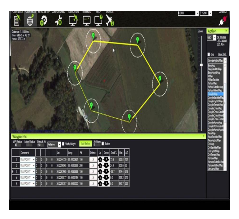
Fig-8: Mission Planner

Mission Planner is a full-highlighted ground station application for the ArduPilot open source autopilot venture. Mission Planner is a ground control station for Plane, Copter and Rovers. It is good with Windows as it were. Mission Planner can be utilized as a setup utility or as a powerful control supplement for your self-governing vehicle. Mission planner is the product which assumes a fundamental job in the activity of the quadcopter. This software is essentially used to make waypoint which will coordinate the quadcopter and using RC transmitter and receiver we can control quadcopter