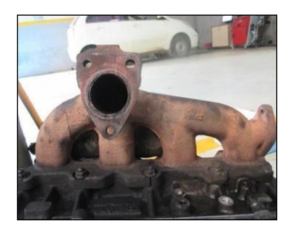
Fig. 1: Exhaust Manifold of Diesel Engine

Due to the increasing and decreasing temperatures to the exhaust gases thermal fatigue produced in exhaust manifold. The pressure waves of comes out to exhaust gases during particular times of the cycle subject internal pressure. There will be developed cracks in the exhaust manifold. [1] Particularly, the efficiencies and the fuel consumption are nearly related to the exhaust manifold. The manifold may be a casting or fabricated which is light material. The purpose of the exhaust manifold is to collect and carried out these exhaust gases away from the cylinders with a minimum of back pressure. [3-4] The effect of this using the momentum of the exhaust gases to create a pressure drop in the cylinder and assisting more air and fuel to enter into the cylinder is called Cadency effect. Design of the inlet and exhaust pipes will careful to maximize the effect. Cast Iron is preferred as manifold's material because the cost and ease of manufacture. For Thermal analysis done the calculation of the temperature distribution, heat transfer, thermal gradients and thermal flux. This is followed by stress analysis, to know the thermal stresses. [3]