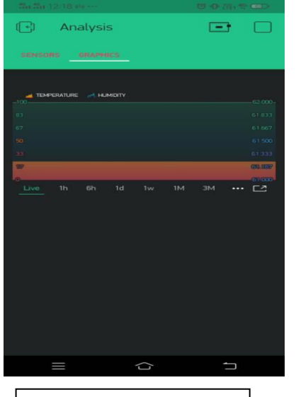
Fig:7 Live Record of the data

We can also generate the data in graph format. For that we need to add a graph widget and configure the settings as required.