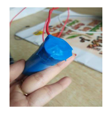
Fig:3 Lithium Battery Connection with NodeMCU & lithium battery charger

So far, we have created a module using the NodeMCU, DHT11 and Soil Moisture Sensor to detect the temperature, humidity and soil moisture content of the plant. As we are using the module locally so we are supplying the power through USB. But we have also created a module to use remotely using lithium batteries for the power supply.