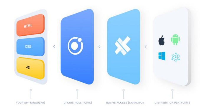
Figure 4: Capacitor in Ionic

Let's see what is Capacitor is and the way it relates to alternative cross platform projects out there. Capacitor follows several of the same ideas as Apache Cordova.