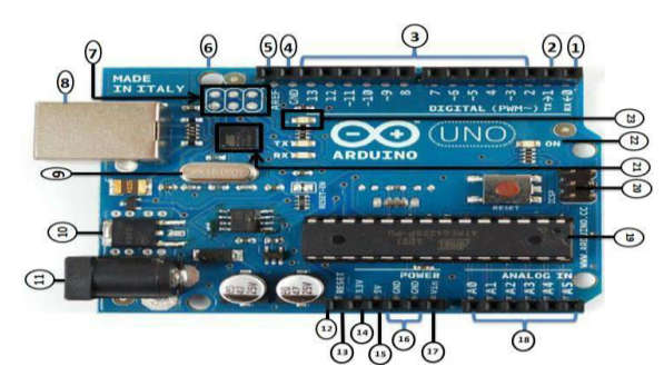
FIG. 3 ARDUINO LAYOUT