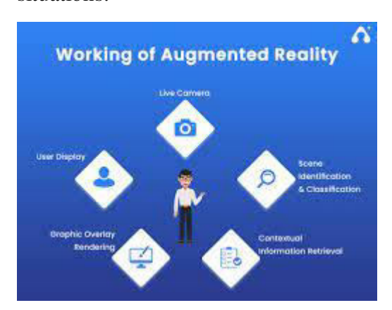
Fig. 2. WORKINGOF AR

According to Grigore and Phillippe, the initial VR make an effort to achieve was passed in the 1960s to cinematographer Morton Heilig, he is the man who sought to expand those visual fields provided by the experiences from the range from eighteen percentage to hundred percentage, putting these three-dimensional facial perspectives of the audience Sensorama, his invention, was patented in 1962. Modern HMDs are becoming more and more useful, with a better and more comprehensive display; at the same time, they are becoming more and more expensive. speedier equipment permits for the superior integrations of virtual objects and genuine with administrations among the the interpretations like more and more complex situations.