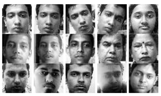
Fig. 3. Training Images