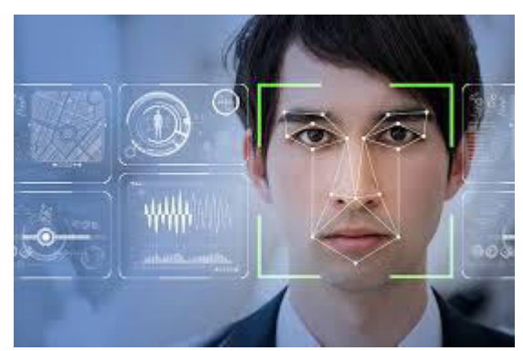
Figure1: Face Detection

3.7 Face Recognition: The features extracted from the image will be compared with the stored features in database with the help of SVM. If the system recognizes the features, corresponding name with the features stored will be marked will present attendance in the database of students detailed.