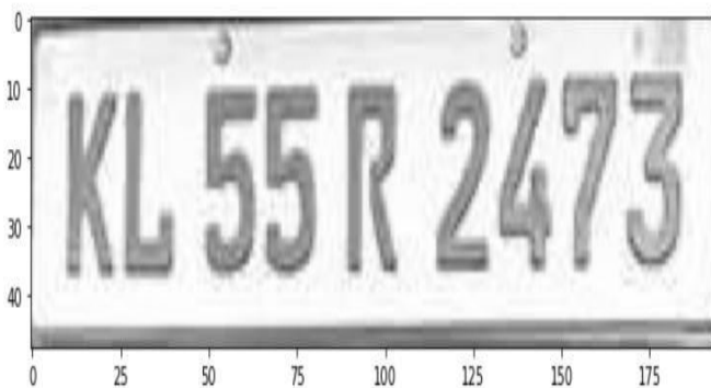
Fig-5: The Estimated Region of Interest.

The image consisting of the region of interest is fed to the OCR (Optical Character Recognition) module. The OCR module is used to convert the image that is inputted to it into text. The various OCR modules like Google Drive OCR or Google Cloud Vision, Tesseract etc. that exists, in this project we have opted to use the inbuilt OCR module