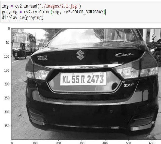
Fig-3: Input Image subjected to Grayscale Transformation

Post Grayscale transformation, various edge detection techniques are applied on the gray scaled image in order to obtain the desired region of interest. The region of interest in this project is only the license plate and not the entire vehicle.