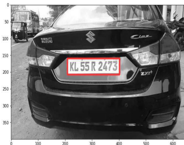
Fig-4: The Detected Bounding Box