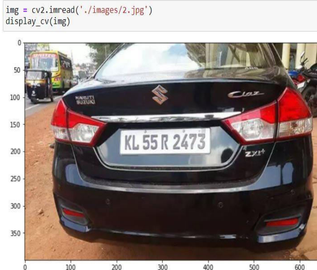
Fig-2: Input Image

As illustrated in Fig-2 and Fig-3, the input picture is grayscale transformed once it is acquired, and several approaches are available to help with this process, one of which is the use of a NumPy array. Because there are other direct ways in Python to convert an image into grayscale image, such as cvtColor(), one may bypass the step of turning the input image into a NumPy array.