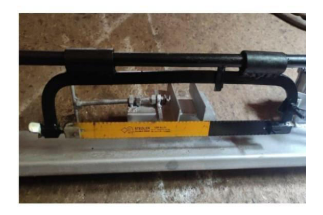
Fig 3. Hacksaw

A power hacksaw (or electric hacksaw) is a type of hacksaw that is powered by electric motor. Most power hacksaw are stationary machines but some portable models do exist stationary models usually have a mechanism to lift up the saw blade on the return stroke and some have a coolant pump to prevent the stop blade from overheating.