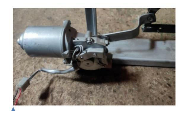
Fig 4. Motor

AC motor is an electric motor driven by an alternating current (AC). The reciprocating motion of the hacksaw blade, because of which the cutting process takes place, is produced with the help of an AC motor, which operates by a simple crank mechanism to convert rotary motion of crank into reciprocating motion of the hacksaw blade. It convert electrical energy into mechanical energy.