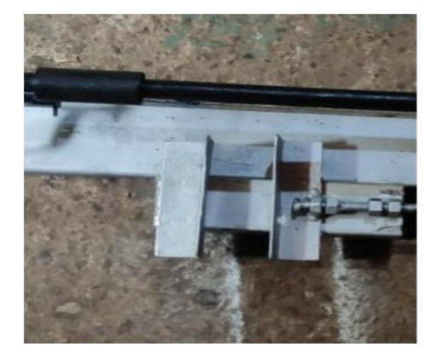
Fig 2. L Channel.