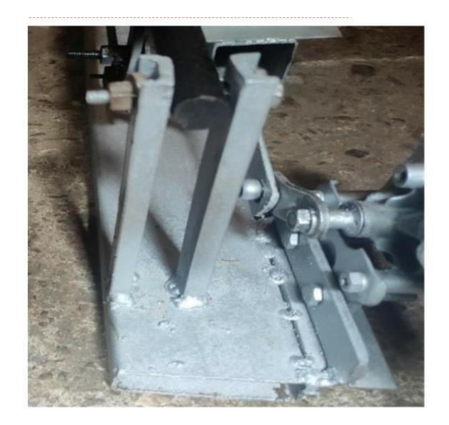
Fig 1. Square plate.

We selected 4 inch plate because to adjust the hacksaw blade. And we select another two of 6 inch because to balance the hacksaw blade if we keep the both end of same measurement than it will become imbalance and due to this hacksaw blade will nit be in control it will move any were.