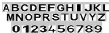
Fig: 1.7 Database of templates

Template Matching is a technique that compares portions of images against one another.