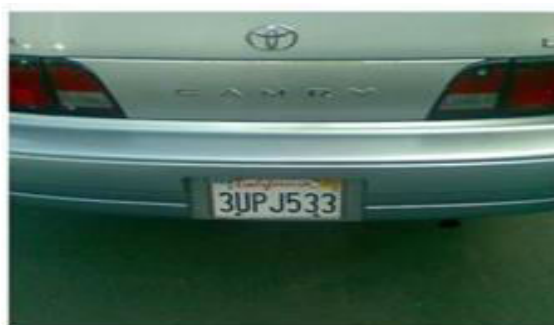
Fig: 1.2 Captured image by digital camera

The first step is the capturing of an image using electronic devices such as optical (digital/video) camera, webcam etc., can be used to capture the acquired images. For this project, pre-captured image will be taken.