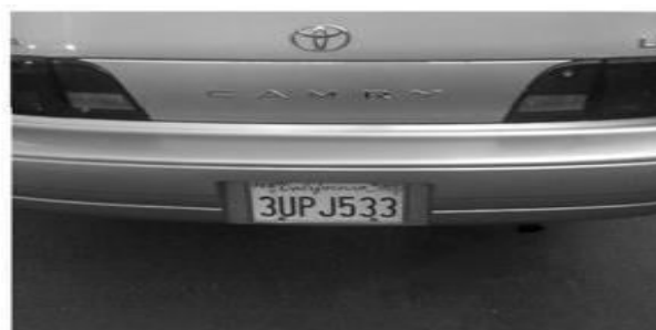
Fig: 1.3 converted from color image to gray image

It involves a conversion of color image into Gray image. The method is based on different color transform. According to the R, G, B value in the image, it calculates the value of gray value, and obtains the Gray image at the same time. rgb2gray() - This command is used to convert the RGB image into Gray-scale format.