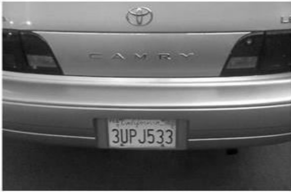
Fig 1.4 Pre-Processed image