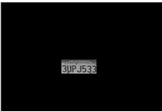
Fig: 1.5 Vehicle Number Plate Extraction

The prewitt edge filter is use to detect edges based applying a horizontal and verticle filter in sequence. Both filters are applied to the image and summed to form the final result. The two filters are basic convolution filters of the form: Horizontal Filter, Verticle Filter.