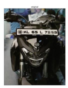
Input vehicle image