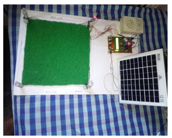
Fig 6.1: Final set-up of SCPS