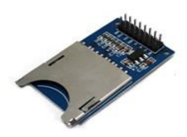
Fig 3.6 SD card module.

The Micro SD Card Module has SPI interface that is well matched with any sd card and it use5V or three.3V strength supply which is compatible with maximum micro controllers forums.SD module has diverse packages which include records logger, audio, video, pix. This module will significantly increase the capability an Arduino can do with their negative restricted memory.