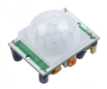
Fig 3.5: PIR sensor module

Flame Sensors, Smoke Sensors, hearth Alarms and many others. Are parts of a safety equipment that help us in maintaining our homes, offices and stores safe from fire accidents. Nearly all modern-day houses, flats, malls, cinema halls, theatres, office buildings and stores are prepared with such protection system and it's miles obligatory in some regions to fireplace protection devices.