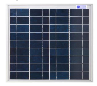
Fig 3.7: solar panel 12volt.