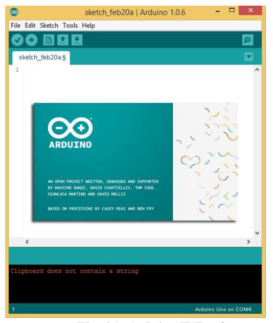
Fig. 4.1: Arduino IDE software