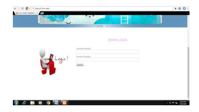
Fig .4: Login page