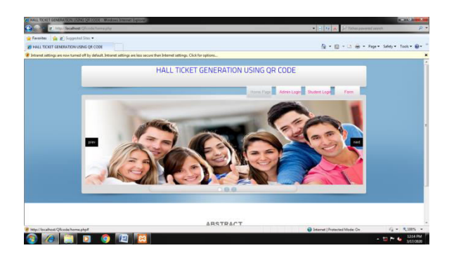
Fig .3: Home Page