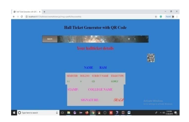
Fig .6:Hall ticket generation