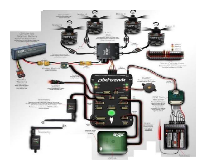
Fig 1. Design of our Proposed System

Pixhawk PX4 flight controller was one of the first and foremost decisions that was made when building this testbed. The Pixhawk also has a solid architecture for connecting with any of the other hardware components that were required; radio controller, GPS, etc. The Pixhawk turned out to be a perfect fit for the testbed in understanding how the system works. The flight controller is the medium between the UAV flying and inputs from the user's handheld transmitter. In the case of autonomous flight the flight controller communicates with a ground station (running on a laptop) and for this research Mission Planner was chosen. Another very similar program that could have been used is QGroundControl.