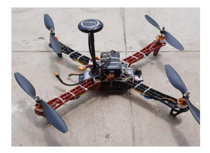
Fig.4 Quadcopter using PX4 board

The complete setup of the quadcopter with all the components connected together can be moved accordingly towards the feed.