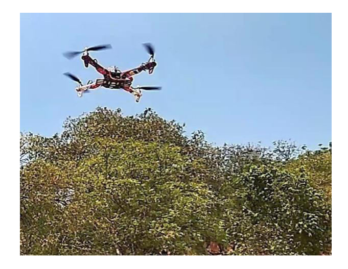
Fig.5 Quadcopter during test flight

The complete setup of the quadcopter with all the components connected together can be moved accordingly towards the feed.