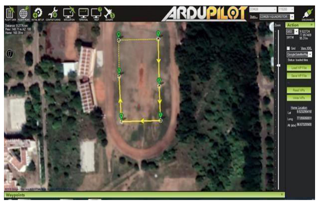
Fig.3 Waypoint Creation in mission planner

The GPS module first retrieves the current location of the quadcopter in the google map using mission planner software. The output of the GPS module is shown in Fig 3. Then the way point is plotted and the path is created using PX4 in the same google map itself. This is shown in Fig.3. The map gets changed once the quadcopter is in motion, and the new waypoint is taken into account and the path is calculated.