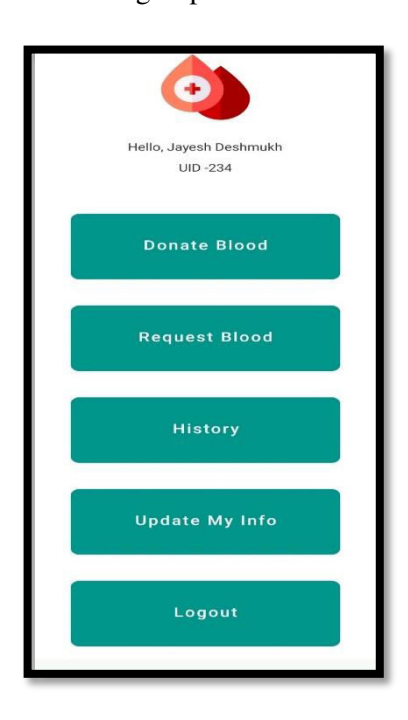
Fig.2: Screenshot of HomeActivity

Then, the request entry will be inserted into database with respective blood group