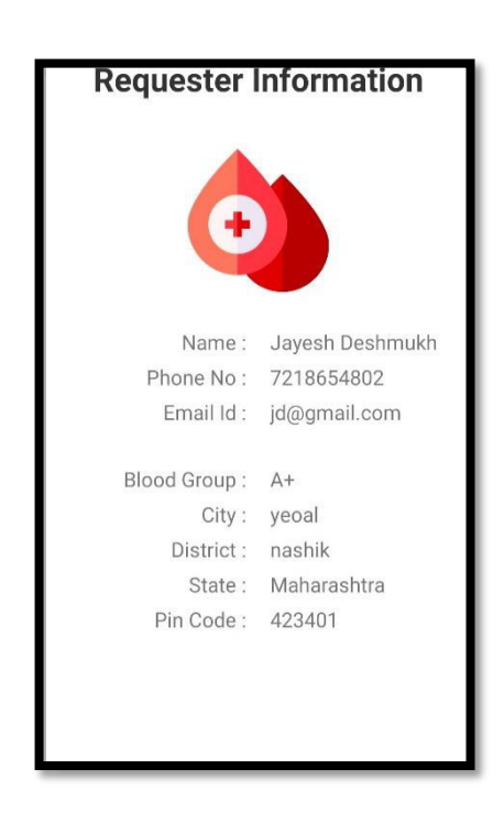
Fig.4: Screenshot of InfoActivity

We have to request blood ,when we register ourselves and then login into application then click request blood button then the blood request would be submitted, then the other user who is willing to donate blood will register himself and press donate blood button and accept any request which is available then he will get all information about requester so that he could contact requester and donate blood.