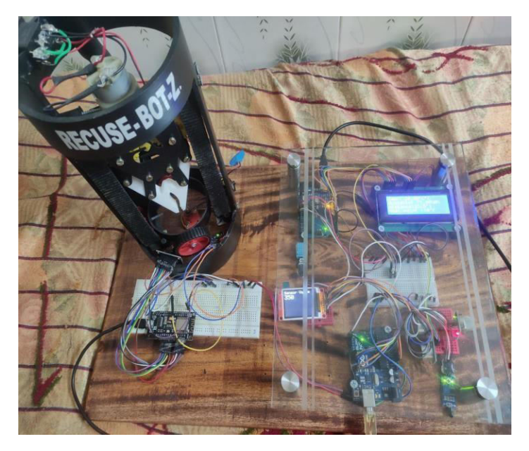
Figure.5 Prototype of borewell RC bot

The data collected through the sensors are stored in the cloud and that data are analyzed. The data stored in the cloud with the help of Node MCU ESP8266 module.