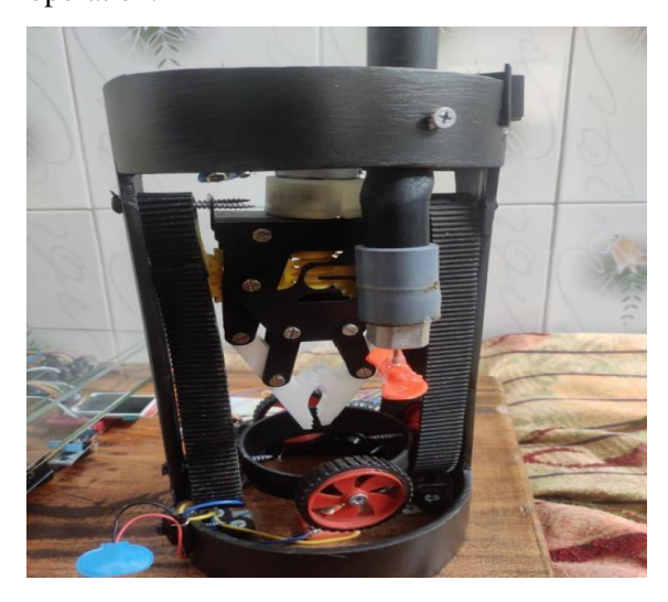
Figure.3 Vacuum suck pump

Vacuum suck pump which helps to hold the head of the child. It gives a additional support to the child and the Thin metal sheet is used to lock the bottom of the bot when the child gets into the bot with the help of robotic arm and Vacuum suck pump .It prevents from further moving deeper into the ground while doing the rescue operation.