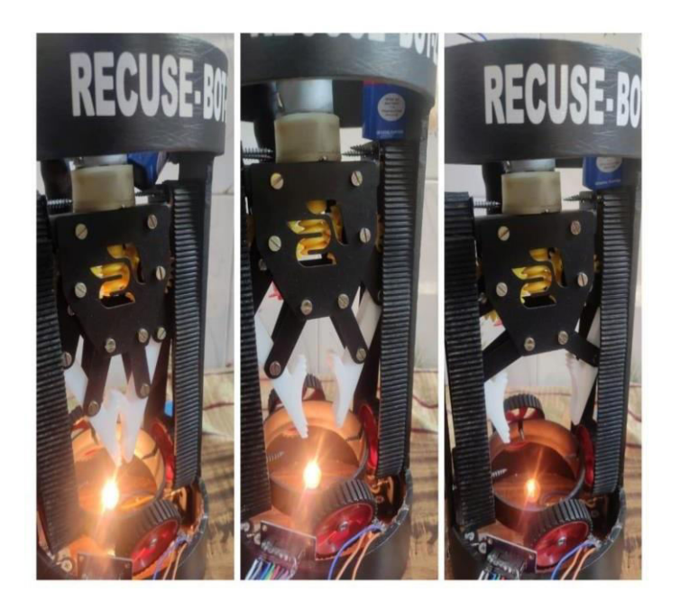
Figure.2. Robotic arm operation

The prototype has been designed successfully for the Borewell RC Bot to rescue the child from the borewell in a secure way. The robotic arm is opened and closed by using a 3 way switch which is operated by a dc motor. The Bot is capable to sustain the all possible loads. Overall our RC Bot is designed to overcome the cons of existing systems.