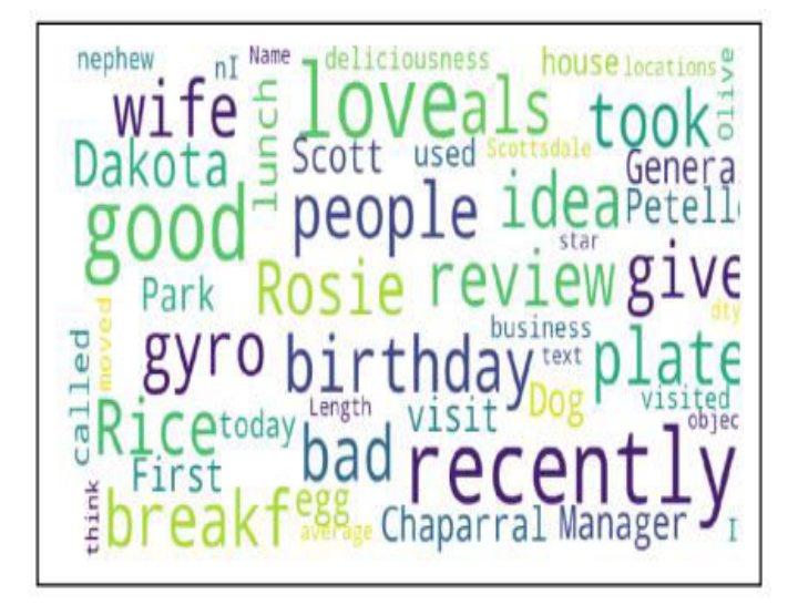
Figure 3. WordCloud from user review

On the raw data, we used Data Filtration, Text Preprocessing, and Feature Extraction, as well as a variety of machine learning algorithms to predict user feedback based on star ratings. Now, as seen in Fig. 3, we have printed some word clouds to see what kind of terms appear in our reviews. Birthday, Love, Concept, Place, Occasion, and other terms are all linked to the reviews. Some terms are more aligned with the customer's contact with the venue.