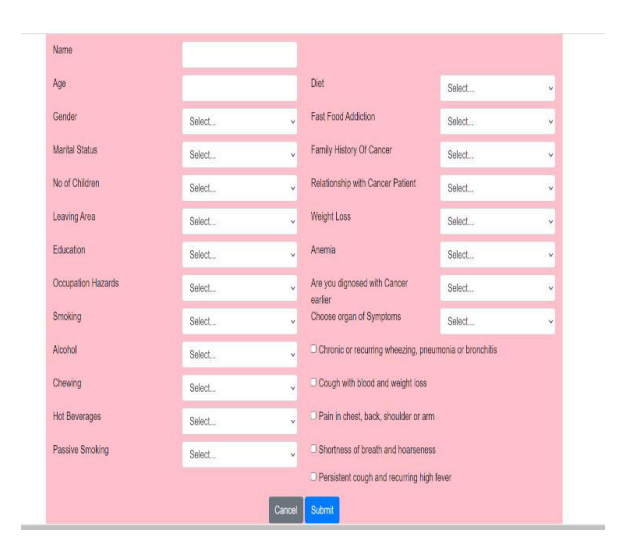
Fig 3: Screen User Input (check cancer status )