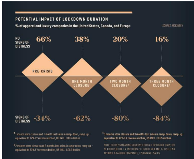
Table -1: Potential Impact of lockdown on Luxury Industry.

of a hospital in Milan. There has been a coalition too amongst several American brands which have been manufacturing masks and providing medical supplies for health centers to keep the supply chain intact and push up sales (Ellis, 2020).