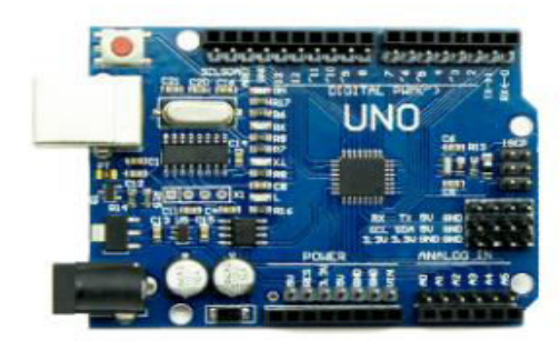
Fig -1: Arduino Uno 680

You can tell your board what to do by sending a set of instructions to the microcontroller on the board. To do so you use the Atduino programming language (based on wiring), and the Arduino software (IDE), based on Processing.