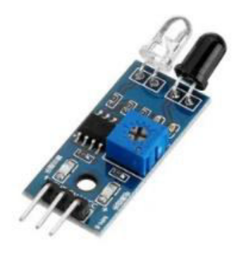
Fig2: IR sensor

Active IR sensors act as proximity sensors, and they are commonly used in obstacle detection systems (such as in robots). Passive IR sensors are most commonly used in motion-based detection, such as in-home security systems. When a moving object that generates infrared radiation enters the sensing range of the detector, the difference in IR levels between the two pyroelectric elements is measured. The sensor then sends an electronic signal to an embedded computer.