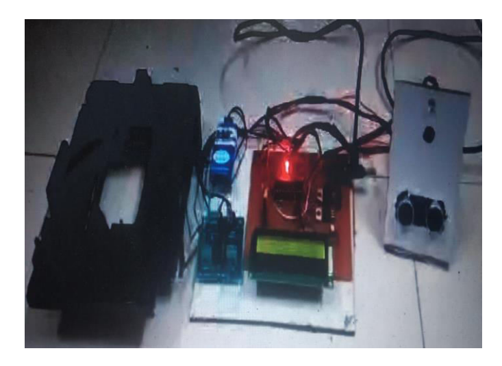
B. Result when Normal temperature detected.