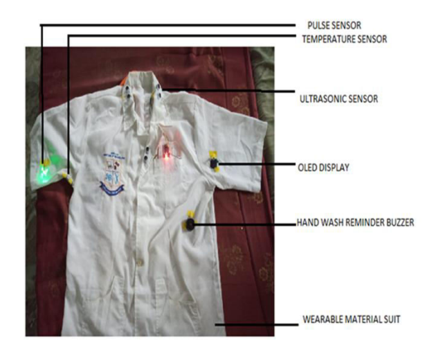
Figure2: Final pic

The implementation of this visualized idea has been implemented on our college lab court to have a testing phase where this project is tested in our college premises.