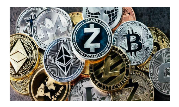
Fig -2: Various cryptocurrencies