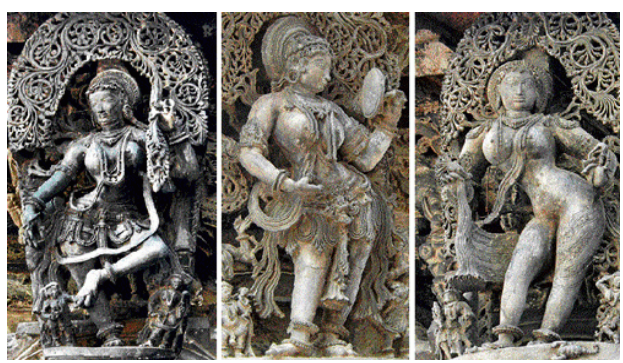
Fig -3: Chennakeswara Temple, Belur

Hoysala temples are the amalgamation of dance and music. The sculptures are ornate and exuberant of all the dance sculptures. They bear the testimony for the transformation of the practicing tradition of dance. The style is distinctive and can be classified in between 'marga' and 'desi' tradition. New poses, ideas and sequences came after incorporating the desi style. The Chennakeshava temple at Belur built by Vishnuvardhana in 1117 AD and completed by Narsimha II has a pillared hall (Navaranga), a vestibule (Antarala) and sanctum sanctorum (Garbhagriha) all set in an axial fashion. The elegance is multiplied due to the delicately carved bracket figures, doorways, walls, pillars, screens and the main deity (Nagrai 1990:18)