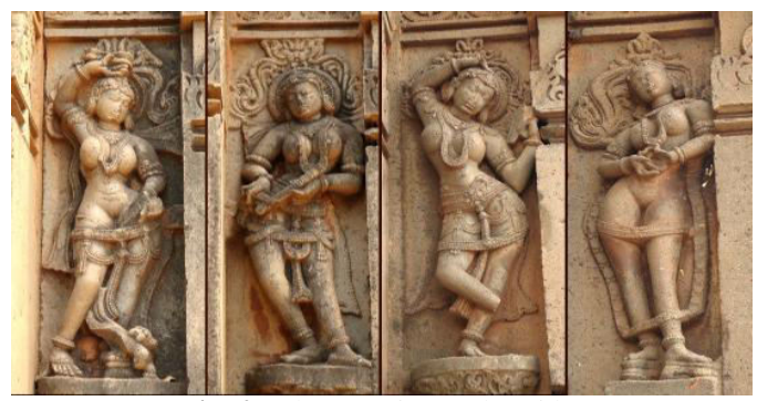
Fig -2: Jalasangavi Temple, Bidar

Fine arts and iterature in south India developed during 973 CE under the rule of Chalukyas of Kalyana. They built beautiful monuments. King Someswara III developed the fields of arts, science, medicine, architecture, music and dance in the monumental work 'Manasollasa'. Fine arts and literature flourished during their rule. The temple architecture was in full swing during their reign. The architecture style developed during the latter Chalukyan period was noteworthy. The temple interiors are richly carved with figures of deities, dancing images and other decorative motifs. The uniqueness of carving dancing girls in the niches and recesses of walls became very popular during this period. Many features of this style were later adopted by the Hoysalas.