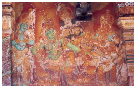
Fig -7: VenkittaThevar Temple, Kottakkal

Kerala known as 'Gods own country' is rich in performing arts like Mohiniyattam, Kathakali, Kudiyattam, Teyyam, etc. The temples have been constructed in a distinctive architectural style with unique features. The temple architecture known as 'Ambalam' is very different and distinct from other regions. The temples have been constructed in wood, stone and metals in simplicity and in distinct style. The temples have no scope for sculptures. However, temples like Anantha Padmanabhaswamy at Thiruvananthapuram has beautifully carved images including dancing figures on the hundred pillars on the pathway around the four sides of the temple. The mantapas also have stupendous carved out sculptures. Temples in Kerala also have nourished the art of mural paintings. The walls are beautifully coloured with paintings which add glory to these temples.