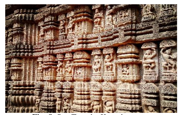
Fig -8: Sun Temple, Konark

Jagannatha temple at Puri and Sun temple at Konark and Rajarani temple.