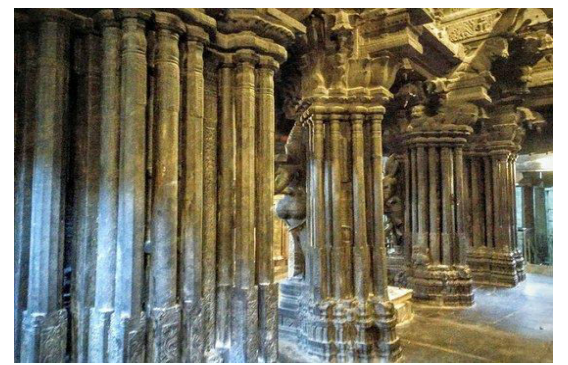
Fig -9: Nelliyappar Temple, Thirunelveli

The tapping pillars produce different sounds in different tones by tapping with fingers on them while blowing pillars generate sound by blowing air through the holes just like wind instrument. It is believed that the stone that emits long and deep sound like a bell is known as male stone, the one which has long vibration like a brass vessel is a female stone and the ones which are uneven and rough are neutral stones. The stones for the pillars are generally three to seven feet long with circular cross section, sometimes square, rectangular, polygonal, octagonal cross sections. Few pillars are with carvings and few without. The ones with carvings add grace and beauty to the structure as a whole. The sculptors select the stone by tapping on it.