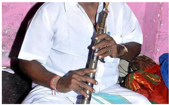
Fig -11: Stone Nadaswaram, Kumbakonam

Apart from the musical columns there are many other objects in the temple that produced sounds –