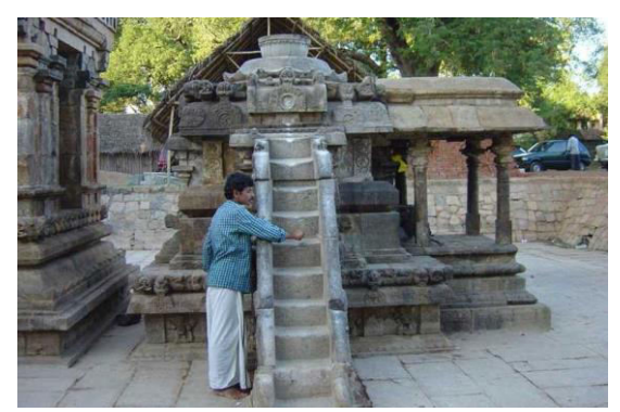
Fig -10: Musical Stairs, Darasuram