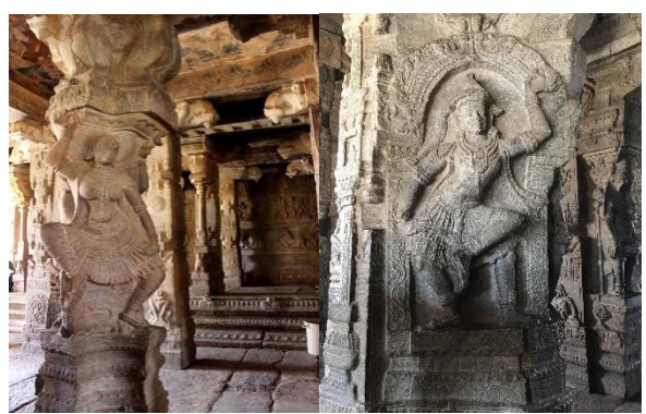
Fig -6: Veerabhadra Temple, Leepakshi

Temples of Andhra and Telangana experience a mixed style of architecture. These temple reveals the history and the patronage of dynasties like the Chalukyas, Eastern Gangas and the Vijayanagara kings. Several temples in this region project out the magnificent art forms that evolved over several centuries. The temple style includes the Chalukyan, Dravidian, Nagara and Odishan style can be seen in the structural temples of these states. The temples built during the early Christian era belonged to the Satavahanas and Ikshvakus era. Temples built in the North eastern part of Andhra Pradesh belonged to the Ganga Kings and reflect the Odisha style of