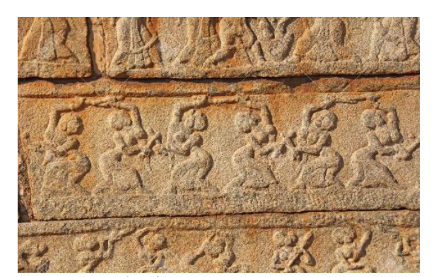
Fig -4: Hazara Rama Temple, Hampi

Vijayanagara empire lasted between 1350 AD and 1565 AD. Krishnadevaraya and other Vijayanagara rulers always encouraged art and architecture. They promoted religion and culture through their buildings and this can be seen through the presence of large number of dance sculptures in the temples. Percy Brown in the praise of Vijayanagara monuments say - It is a record in stone of a range of ideals, sensations, emotions, prodigality, abnormalities, of forms and formlessness, and even eccentricities, that only a super imaginative mind could conceive, and only an inspired artist could reproduce (Brown 1942: 91). The performing arts are reflected through the sculptures of Vijayanagara temples. Pillars of Virupaksha and Achyutaraya temples have splendid dance sculptures both in 'marga' and 'desi' karanas. Dancing sculptures depicting Holi dance sequences are best carved on the outer walls of the Hazara Rama temple. The sculptures on the Achyutaraya temple, Vijaya Vitthala temple and Krishna temple have rare and beautiful dancing poses in both 'marga' and 'desi' style.