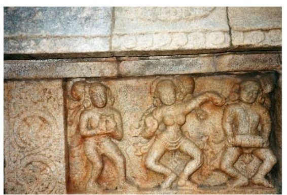
Fig -5: Airavateswara Temple, Darasuram

The temple town of Kumbakonam has both Vaishnavite and Shaivite shrines. Sarangapani temple, Kasi Vishwanath temple and Kumbeshwara temple are known for their sculptures. Sarangapani is the important Vaishnavite temple. The pancharangakshetra was built by the Nayaka rulers in the 15th century. The temple has twelve storeyed towers. The garbhagriha is in the form of chariot. The representation of margakaranas can be seen in the temple. In the interior, pillars and ceiling panels are decorated with various postures from desi charis and karanas. The famous Airavateshwara temple at Darasuram is known because of its intricate and beautiful sculptures. The temple built by Rajaraja Chola II in the 12<sup>th</sup> century is in the form of a chariot being pulled by elephants and horses. The temple is the best example of Chola architecture. The door frames, adhistanas and outer prakara walls have dancing sculptures both of graceful and acrobatic nature. Also, the pillars of mahamantapas and ardhamantapas are decorated with ornate dancing figures.