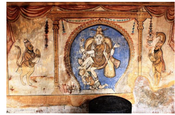
Fig -1: Painting at Brihadeeshwara Temple, Tanjore

Painting is an expressive, two-dimensional art. The early representation of paintings in India is well documented at the pre-historic sites of Bhimbetka. According to ChoodamaniNandagopal - Paintings, the art form and pictorial statement are the outcome of the aesthetic temperament of Gupta-Vakata period during 3rd to 5th century A.D. The cave paintings of Ajanta have been proved as one of the greatest eras of significance in terms of techniques and vibrancy of expression in the history of world painting. Quality of Rhythm can be seen on the walls of through chitra starting from chouri bearer BodhistvaPadmapani. Every figure is coated with the force of the rhythm, elegant poise and spontaneity in emotions and movements. The fabulous paintings of a dancing scene from Cave I, Mahajanaka Jataka draws a special attention. This is a circular composition where the dancer is the centre of attraction, she is in a position of intermediary movement and the artist has lent fluidity in the posture. The head gear, curved hands, angular bending of knee and waist indicate a circular movement, in all it associated with the present odissi form of dance. Another depiction of dance in Ajanta painting is in the scene of the Temptation of Buddha where the dancers have acquired swastika positions with kapithahastas. This posture is identified as an avahittasthanka a standing for nayikas, divine beings like Parvati, Lakshmi and other Devanganas .