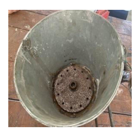
Figure 2.6 Hopper