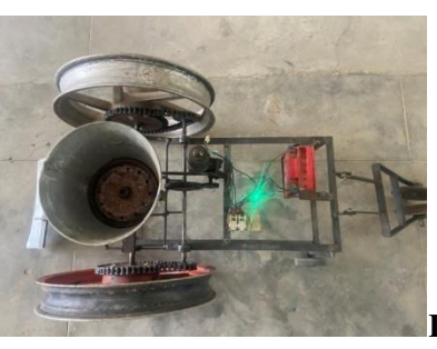
Figure 3.2 Side View

\geq By increasing the equipment strength and quality to its peak, we can have multipurpose agricultural equipment for life time usage. By providing hydraulics, gear arrangements and some minor