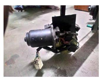
Figure 2.5 Wiper Motor