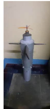
Fig 3: Fabricated Outer Shell Prototype

The material used to fabricate the outer shell is PVC pipes, the front section is hollow leaving space to place the drone, and the back section consists of four fins for directionality. There is a brushless DC motor attached with five bladed propellers present in the rear end which gives the propulsion for the launch vehicle. The motor is attached with an electronic speed controller to control the speed of the launch vehicle. It is powered by a 2200 MAH lithium polymer battery and five servo motors are present to control the angular position and velocity of the torpedo.