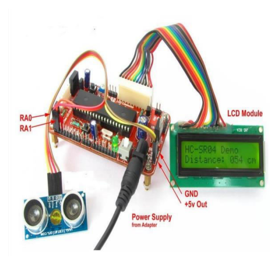
Fig. 2. Ultrasonic Sensor Kit

Ultrasonic Sensor are device that use electricalmechanical energy transformation to measure distance from the sensor to the target object by emitting ultrasonic sound waves. Ultasonic waves are longitudinal mechanical waves which travel as a sequence of compression and rarefactions along the direction of wave propagation through the medium. Apart form distance measurement they are also used in ultrasonic material testing (to detect crack, air bubbles, and other falws in the products), Object detection, position detection, ultrasonic mouse etc. -Here we use HC SR04 ultrasonic sensor, this sensor is mainly used for object avoidance in various robotics project operating current of sensor is 15mA, operating voltage is 3.3 to 5V DC, measuring distance is 2cm to 80cm.