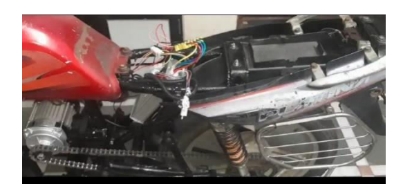
Fig.12 Hardware Design

We have installed all the components on the bike and the connections are made through the controller, which is the main component of the bike. All the signals are received by the controller and all the signals are given by the controller connections are labelled and were easy enough to join to every component.