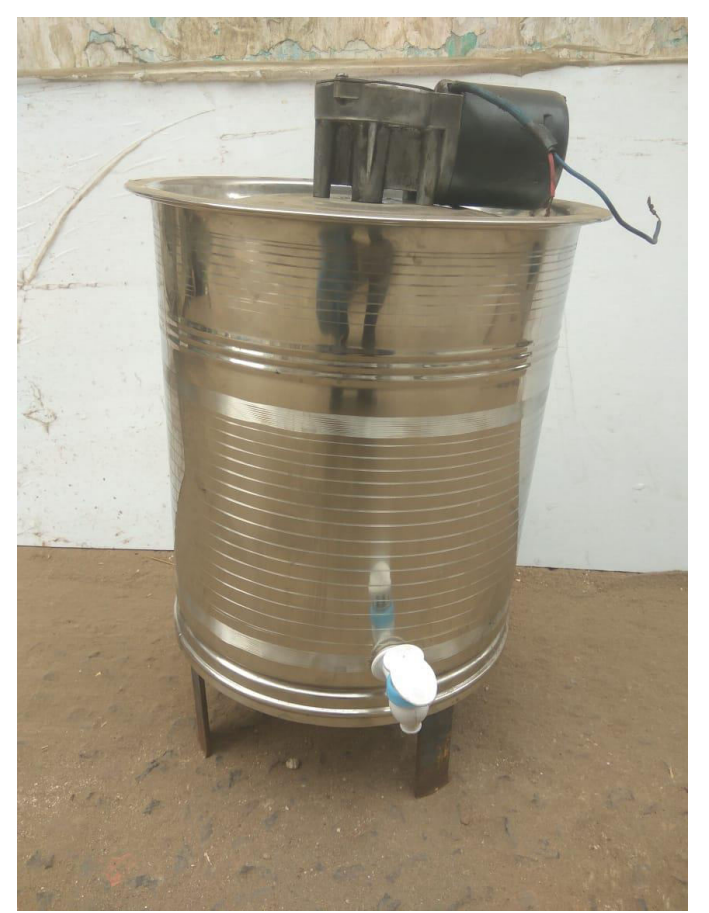
Figure2. Working Model Design