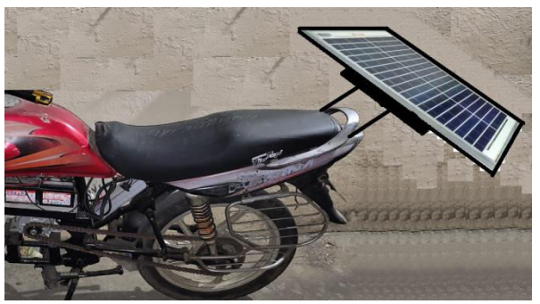
Fig.2: Circuit implementation