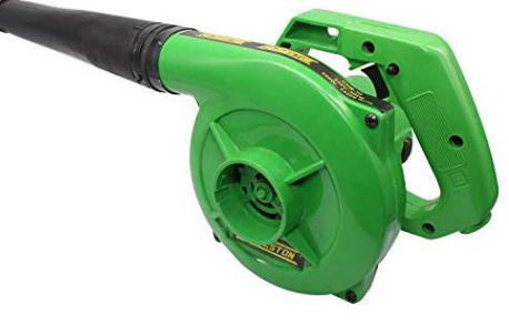
Fig -3: Blower