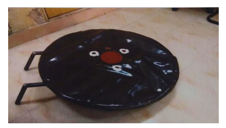
Fig -4: Distributor

As we have taken air distributor as rexine because rexine carries high pressure of air than any other material. The rexine was attached to the wooden plywood by applying hard rexine, crape and staples from staple gun. Then we made 6 small circles of equal radius at a certain distance so as for the perfect balancing of the objects. Because of this 6 circles the air gets distributed in a perfect manner and the plywood gets lifted and the plywood moves forward.