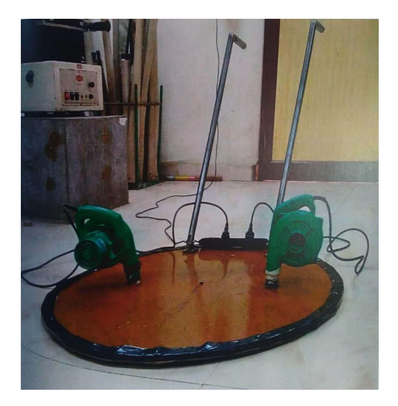
Fig -8: Assembly of Air Cushion Mobility System

Thus the assembly of Air Cushion Material handling System is completed.