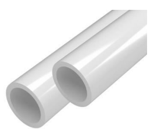
Fig -6: PVC Pipes