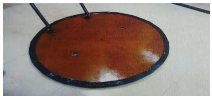
Fig -5: Platform

2) Economically feasible: - It is an also economical because if we use mild steel plate will be more costly and also the machining problem will be there. So we have used a wooden platform. In order to increase the aesthetic view and ergonomics, we have provided a rubber pad of 5mm thickness over the platform and then in order to prevent change the edges of the wooden board are plated by aluminum plate to four sides. The plates are fixed to the board by nailing.