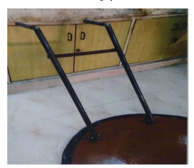
Fig -7: Lever

We attach a lever to move in a particular direction. The lever is light in weight as it is made up of fabric material. Due to this lever, we can control the direction of our system known as Air Cushion Material handling System.