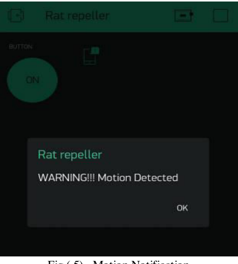
Fig (5). Motion Notification