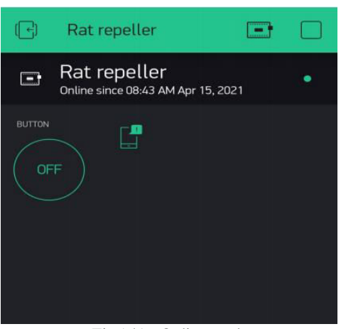
Fig ( 4 ) . Online mode

VOLUME: 05 ISSUE: 07 | JULY - 2021 ISSN: 2582-3930