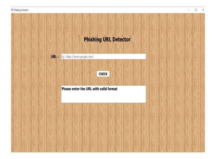
Fig -11: GUI when no URL entered