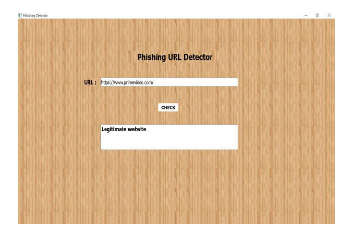
Fig -10: GUI showing legitimate website