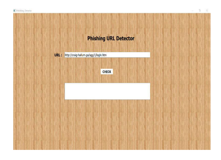
Fig -8: GUI when user enters a URL