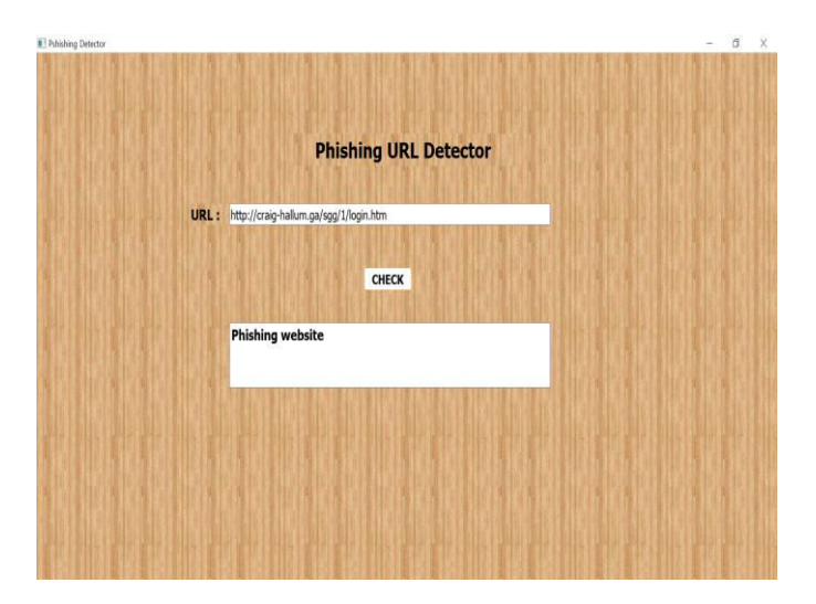
Fig -9: GUI when showing Phishing website