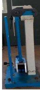
Fig 3 Izode & Charpy impact test