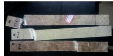
Fig 6 Tested test piece

Properties of composite for 15mm length of coconut fiber