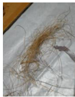
Fig 4 Coconut fiber

Preparation of fiber:- The coir fiber is made from coconut husk, which is dried under sunlight and fibers were extracted manually from the coconut husk. To ensure interaction between fiber and matrix material, the outer most wax layer of the coconut fiber was removed and soaking the coir in hot water.