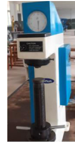
Fig 2 Brinell Hardness testing machine

Brinell hardness test is used to test materials that are too rough or too coarse. In this test a constant load is applied in a range of 500-3000N for a specified time period 10-30s using 5 or 10mm diameter hardened steel on the flat surface of work piece.