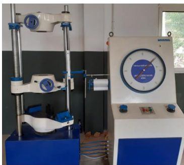
Fig 1 Universal testing Machine

Tensile test is also known as tension test, which is most common type of mechanical testing. It is the process that gives the information about tensile strength, yield strength and ductility and metallic material. It also measures the force required to break the composite material and the extent to which specimen stretches to the breaking point.