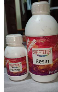
Fig 5 Epoxy resin and Hardner