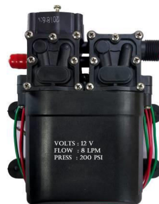
Figure 3 DC Motor