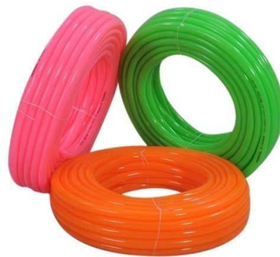
Figure 6 Pipes

It is a connection between tanks to spray gun that helps to regulate required pressure from tank to sprayers.