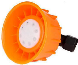
Figure 5 Nozzle

A sprayer of this type is a great way to use Hybrid energy. Solar based pesticides sprayer pump is one of the improved versions of petrol engine pesticide sprayer pump. It uses the solar power to run the motor. So it is a pollution free pump compared to petrol engine sprayer pumps.