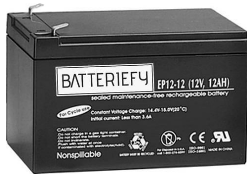
Figure 2 Battery