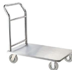
Figure 7 trolley

The trolley are generally used to the transport a material one place to the another place.