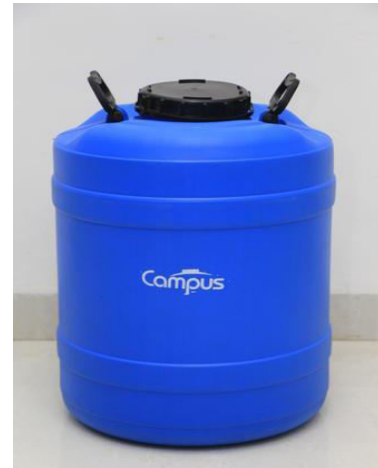
Figure 6 Tank