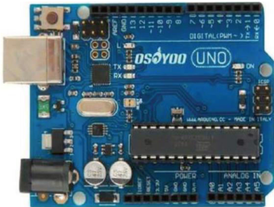
Fig: 1 Arduino UNO