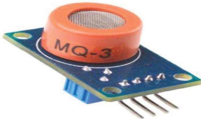
Fig:4 MQ3 Sensor