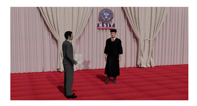
Fig -2: Professor and Student 3D models

We used the tool Blender as it is free and an open-source 3D creation suite. It supported in creation of the 3D pipelining, modelling, rigging, animation, simulation, rendering. It well suited for us and got benefit from its unified pipeline and responsive development process which is a cross-platform and runs equally well on Linux, Windows and the models developed are shown in the Figure 2.