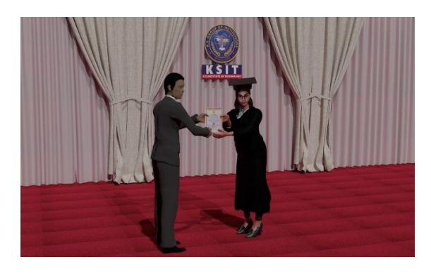
Fig -4: Face-swapped 3D models

9. There will also be an option to merge multiple videos to play each video back to back.