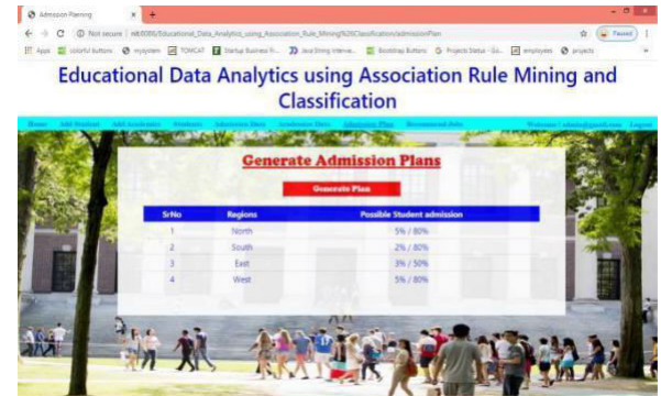
Fig: Admission plan

For the first research question, how data mining can help admission working process. To answer this question, we selected association rule mining as a mining tool to discover interesting relation between features. The threshold of minsup and minconf are configured as above.