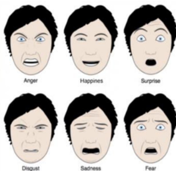
Fig 1. Types of emotion

emotions and most people don't like them because happiness is a good emotion and everyone wants to enjoy it.